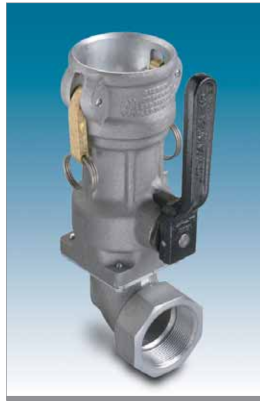
Older Non-locking Style - Still Available This Coupler is a bit shorter than the newer locking handle coupler.