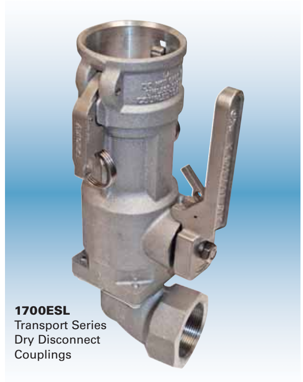
1700ESL Transport Series Dry Disconnect Couplings

Ease of Use – Built-in elbow swivel and simple connection and disconnection design provides freedom of movement and smooth operation.